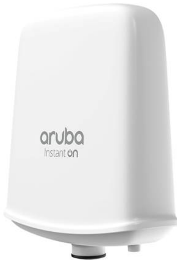
Aruba Instant On AP17 Outdoor Access Points

The Aruba Instant On AP17 outdoor access point is the ideal solution for expanding coverage and signal strength for any wireless network. The outdoor-rated enclosure is designed for harsh outdoor environments, extending quality Wi-Fi to outdoor seating areas in restaurants and cafés, or patios and swimming pools in boutique hotels.